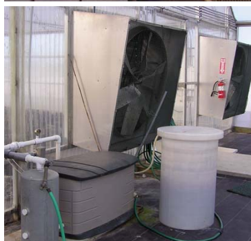
Figure 2. Time-sensitive breeding takes place in greenhouses (top), in which temperatures are controlled by fan-driven evaporative coolers (bottom) to maintain the ideal growing range. In the past, high-voltage surges destroyed the well pump that supplies the coolers, causing greenhouse temperatures to rise to 115° to 125° F and destroying several years' work in a single afternoon.