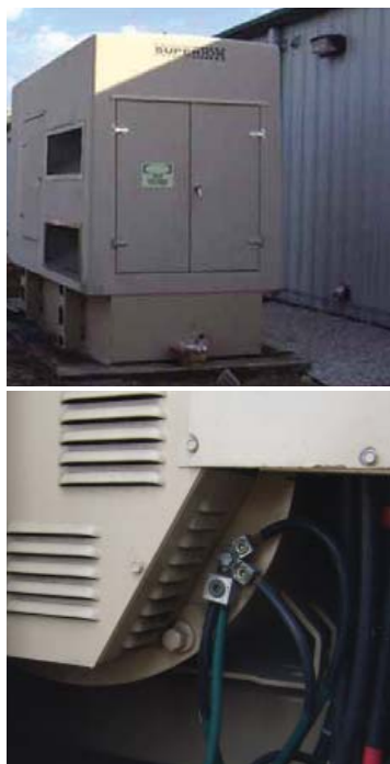
Figure 5. A 200-kVA emergency generator (top) powers the research station during outages. New, 1/0 AWG grounding conductors (green wires, bottom) were installed as part of a system-wide upgrade.

power quality problem and brought in a PQ specialist, John West, founder and president of Power Systems Innovations, Inc. (PSI), headquartered in Orlando. PSI operates nationwide but is especially well known for grounding and power quality work in Florida. Together, the two set out to protect the seed farm from further damage.