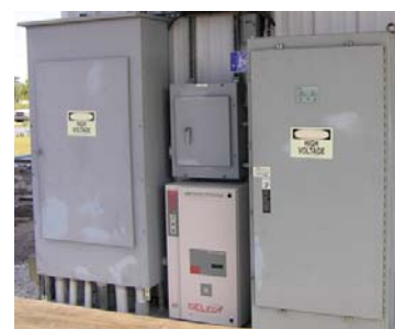
Figure 6. A portion of the service entrance showing a 200-kA-rated SEL 200 SPD mounted on the main panel and a smaller SPD on the panel at right. Other panels, here and throughout the station, were also surge-protected, as well as the well pump.

Surge suppression devices and all other types of voltage spike protection can only function properly when they are bonded to a low-resistance, low-impedance grounding system. Recommended practices suggest a maximum system ground resistance of five ohms.