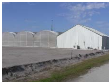
Figure 1. The Harris Moran Seed Company's Research Station comprises a laboratory, offices, 12 greenhouses and several acres of cropland. Years of research & development results were threatened due to a poor electrical grounding system.