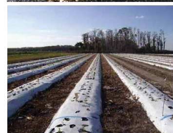
Figure 4. Injectors (top) supply irrigation and nutrients to seedlings (center) and seed crops (bottom). High-voltage surges damaged this electronically controlled system.