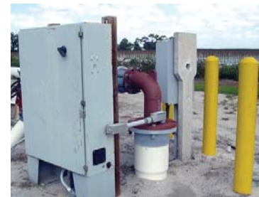
Figure 3. A 25-hp pump draws water from a 60-ft deep well at the Harris Moran Research Station. The well's plastic casing does not provide a natural grounding path. That fact, plus poor grounding elsewhere on the station led to several pump failures.