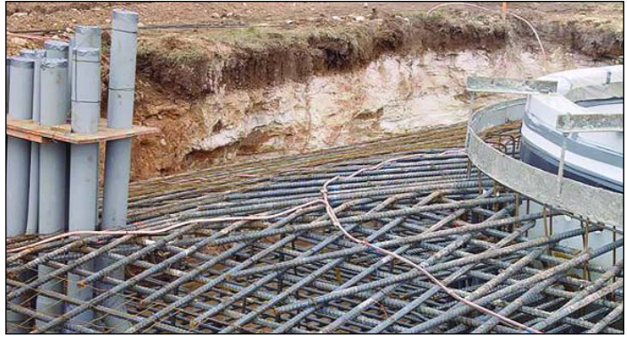
Figure 2. A ring of 250-kcmil copper is bonded to rebar in the footing skirt. The ring connects the conductors shown here with the ground ring shown in Figure 3.

copper ring within the base that is, in turn, bonded to rebar in the tower's foundation ( Figure 2 ). Copper leads extending outward from that inner ring connect to four, 5/8-in x 8-ft copper-clad grounding electrodes, which in turn are bonded to a copper ground ring that completely encircles the pad ( Figure 3 ). Ground rings at all turbines are connected to all