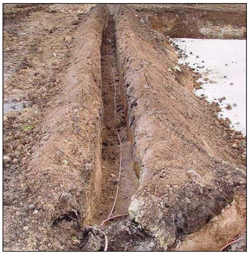
Figure 3. The footing skirt is encircled by a 250-kcmil copper ground ring, which, in turn, is bonded to four 8-ft copper-clad electrodes (foreground). Ground rings for all turbines are connected, again using 250-kcmil copper, thus establishing a uniform <1.5-\Omega ground potential for the entire wind farm.

others to form a single, networked grounding system for the entire facility having an aggregate resistance of less than 1.5 \Omega . The grounding system and neutral conductors, together, use 30,000 linear feet of 250-kcmil copper cable.